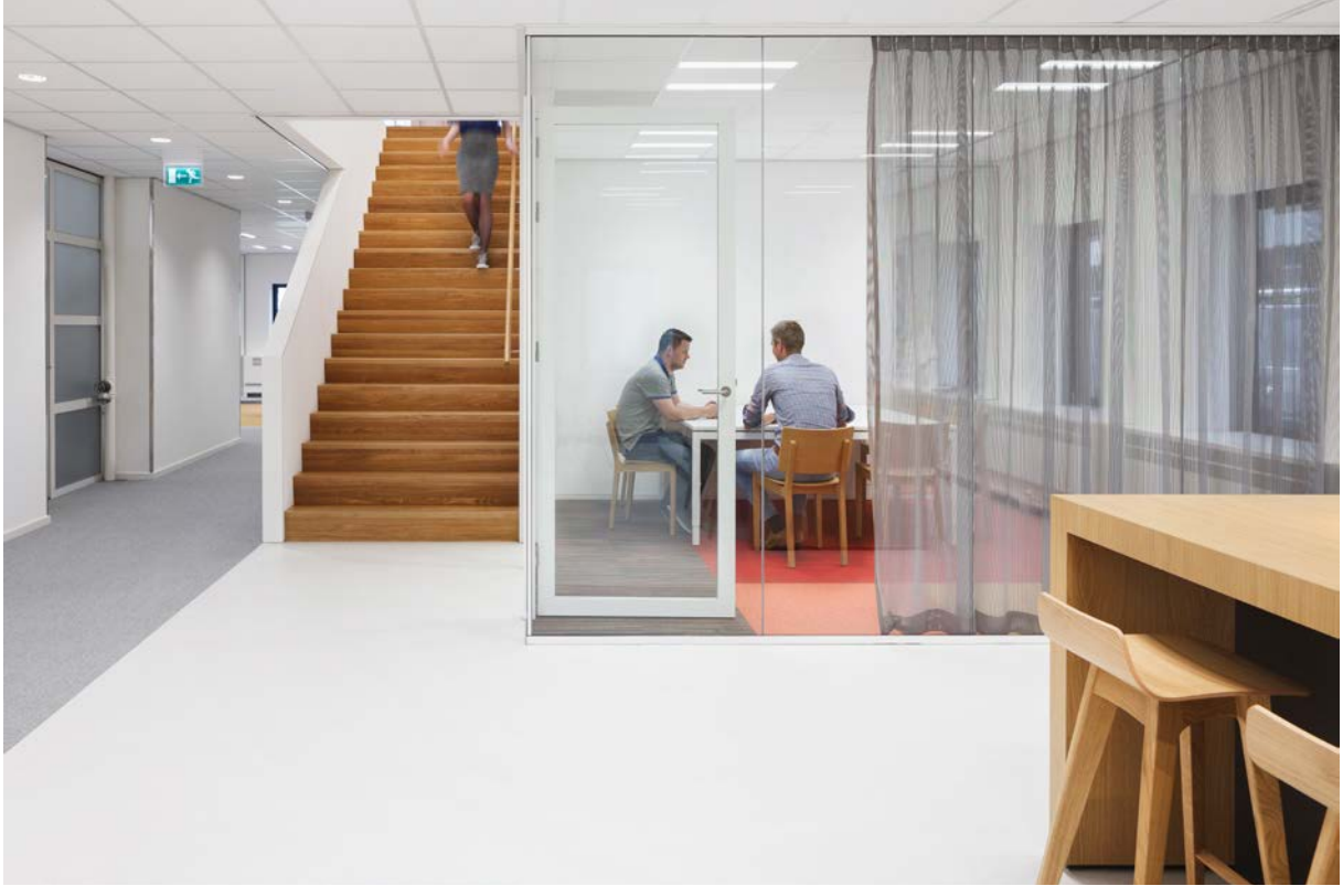
The adding of glass walls and open departments makes the spaces transparent and meanwhile a nice bright work space.